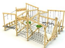
Trim Trail Project Total £16,495.00

If anyone knows of any businesses who would like to sponsor our new outdoor area, please contact me.